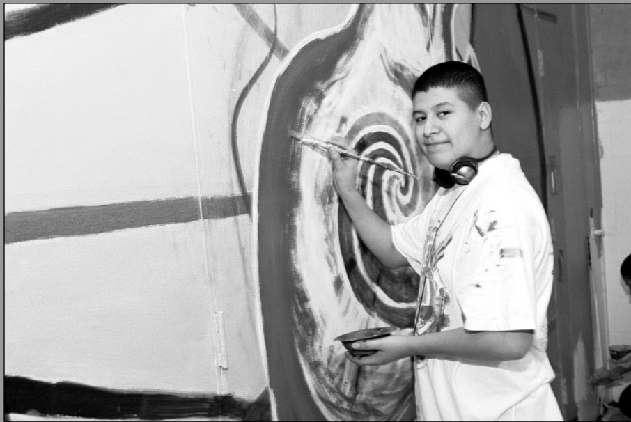
Gallery 37 Apprentice, Spring 2002.